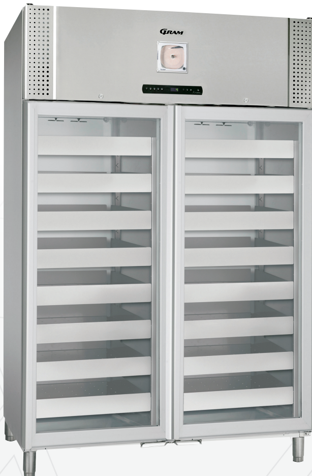
BioBlood BR1400. Drawers and chart recorder are optional extras.

The BioBlood 1270/1400 design is customised to meet the special requirements associated with the controlled storage of blood, plasma and blood-related products.