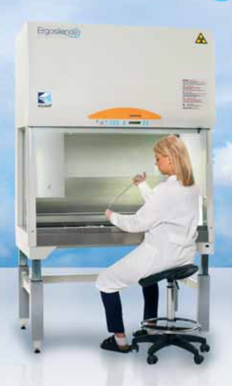
Pure silence, advanced ergonomics