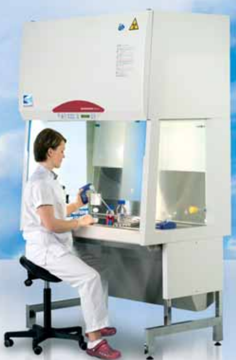
3-filter technology cytotoxics DIN 12980, microbiology EN 12469