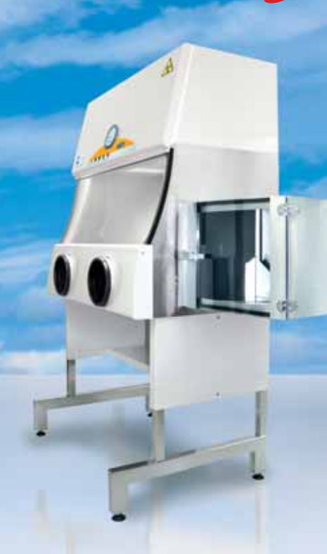
For protection of both the operator and the environment