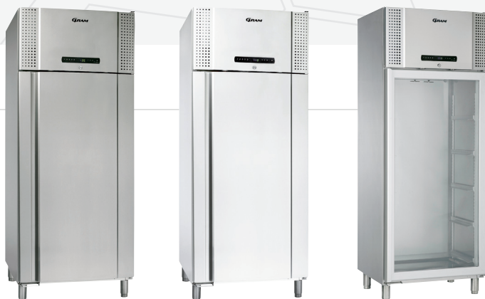
The BioPlus 600/660W is available as a refrigerator or freezer in either white or stainless steel finish. All BioPlus models come with self-closing door. Glass door is available for refrigerators.

In terms of performance, these units are designed to provide the very best results even under exceptional conditions. The BioPlus utilises environmentally responsible HFC-free foam propellants and is available with CFC-free or HFC-free refrigerants.