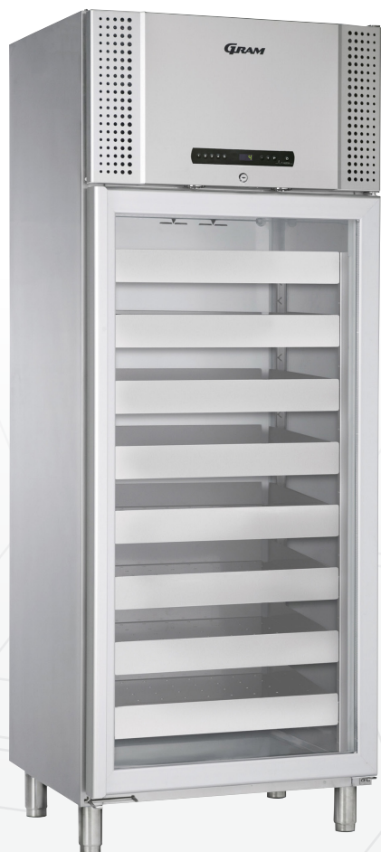
BioPlus 600/660W. Drawers and glass door are optional extras. (Glass door for ER only).

The BioPlus 600/660W range is designed for the storage of the most delicate biomaterials, in situations where even tiny fluctuations in conditions inside the storage cabinet can have a serious effect on the contents.